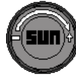
Kit 991-238 (Option E)