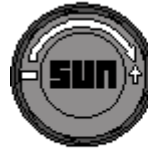
Kit 991-238 (Option E)